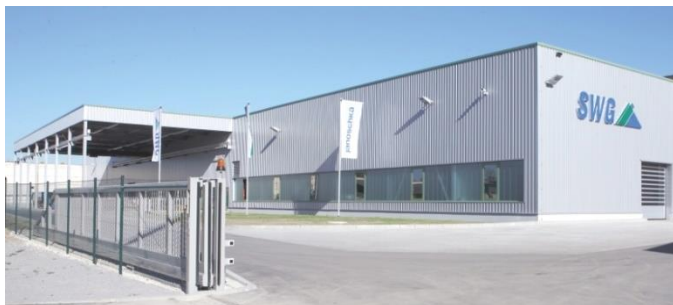
SWG facilities in Frankenberg, Saxony