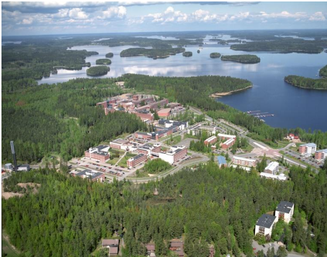
LUT Campus at lake Saimaa

Another research unit of LUT Laser is in Turku, which is located on the south-western coast of Finland. Today, LUT Laser is one of the most well-known laser processing research centres in the Baltic Sea region and the best known research areas are laser and hybrid welding processes for the heavy industry.