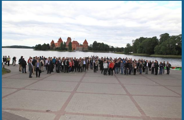
Attendees of LPM 2014 during excursion to Trakai

The symposium is held in different countries every year: Japan, US, Germany, Canada, Austria and was organized this year by the Center for Physical Sciences and Technology in Lithuania, coordinator of the FP7 project APPOLO. Partners of APPOLO project were also responsible on the special session on Lasers in photovoltaics and were authors on a good number of oral and poster presentation, reflecting achievement in project work packages.