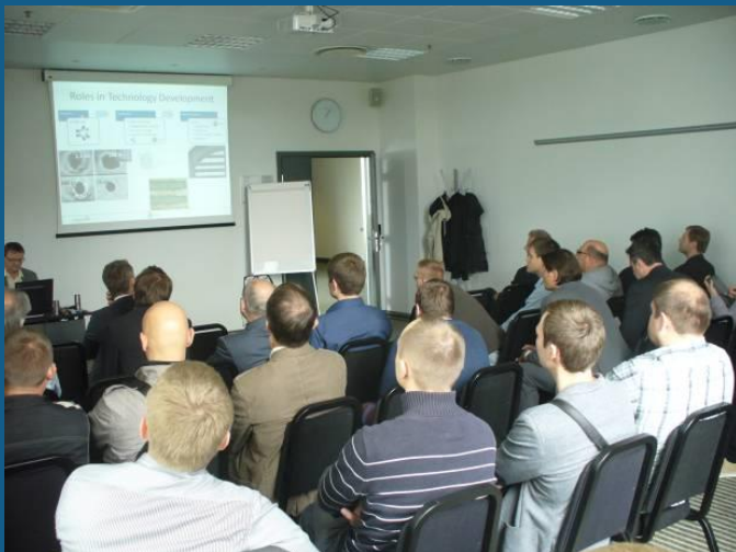
APPOLO workshop for industrial laser users in Vilnius

At the 15 th International Symposium on Laser Precision Microfabrication (LPM) in Vilnius on June 16 th 2014 members of the APPOLO project (FTMC, IOM, LUT, UAB) successfully organized in conjunction with the LPM a workshop on the topic 'New Processes and Opportunities in Use of Laser Technologies in Industry'. The workshop attracted representatives from 13 companies and had around 80 participants. Part of the day were an introduction on the APPOLO project, 3 presentations on laser technologies, 3 on laser systems and a final round table discussion.